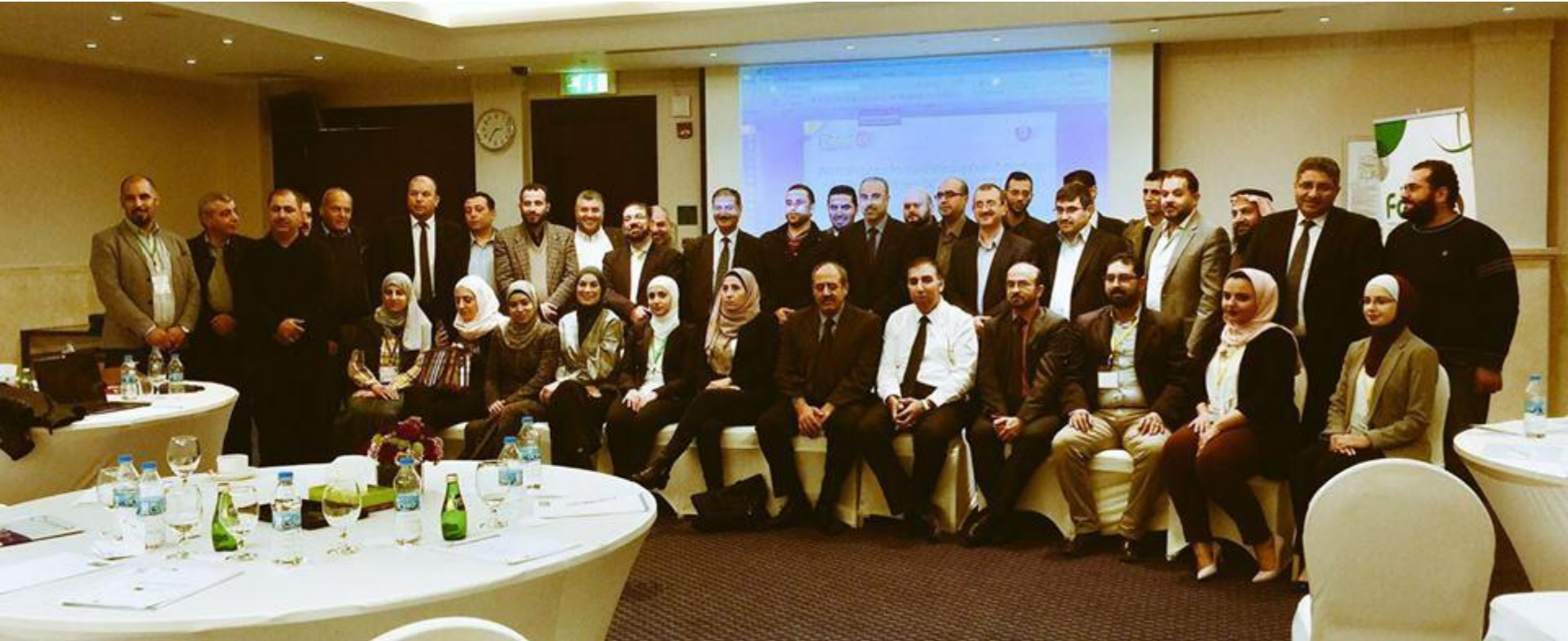
FoodQA Project Meeting in Holiday Inn, Dead Sea, Jordan