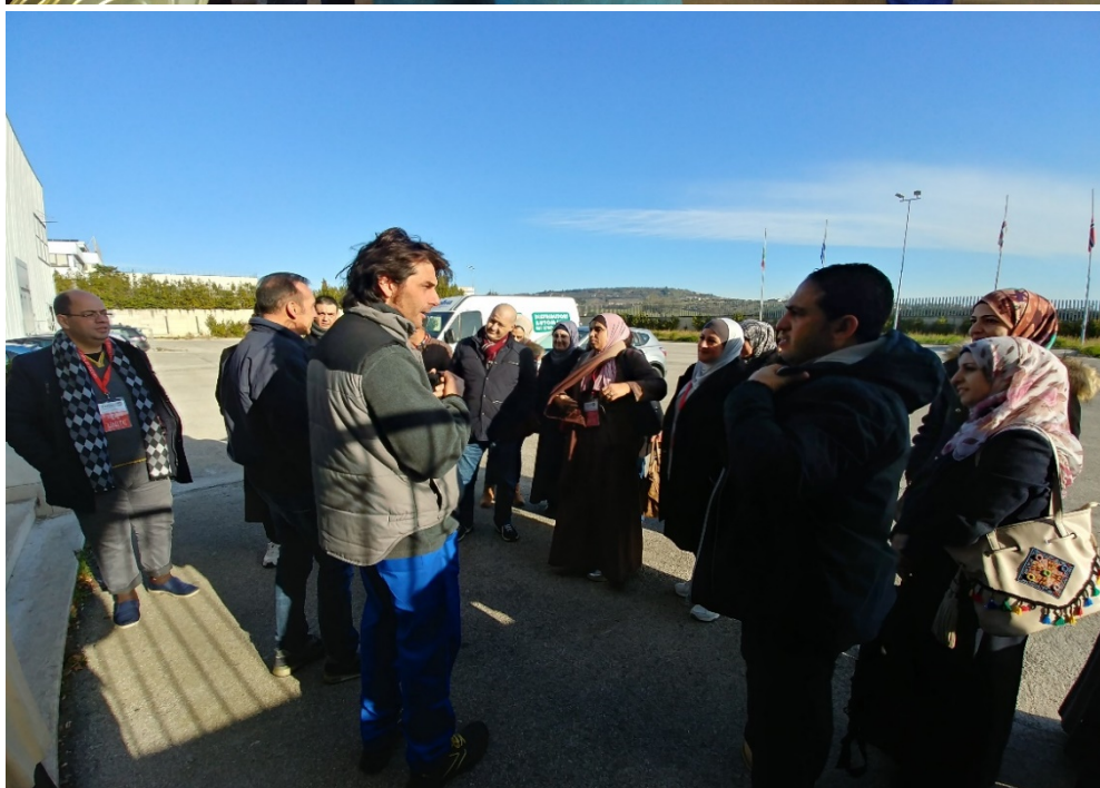
FOODQA Group in visit at Monti, food factory