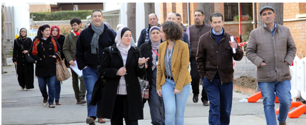
FOODQA Group in visit at IZS