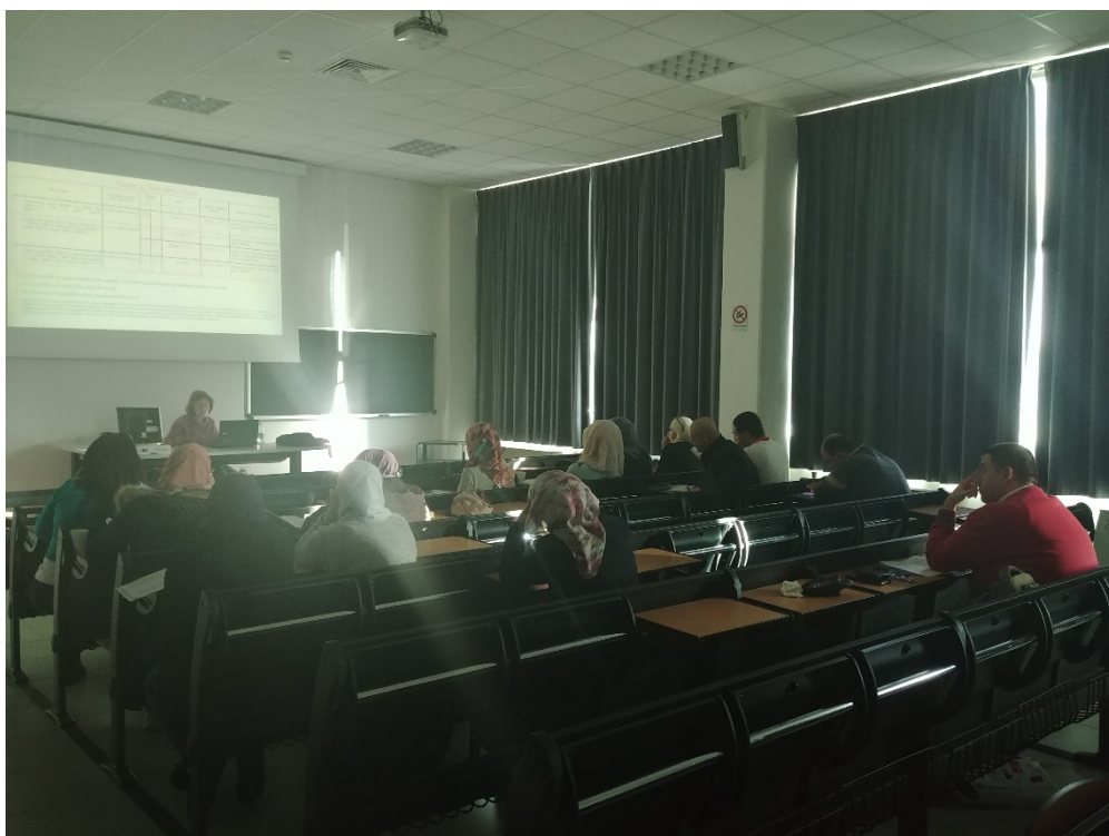
FOODQA training @ UNITE